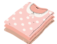
extra clothing including socks