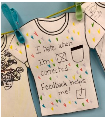
Carlisle, Div. 5