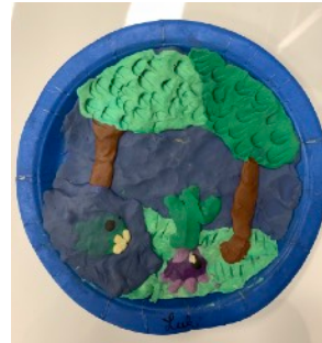
Luke, Div. 9