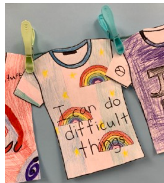
Kandace, Div. 5