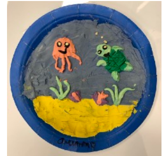
Autumn, Div. 9