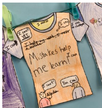
Ella, Div. 5