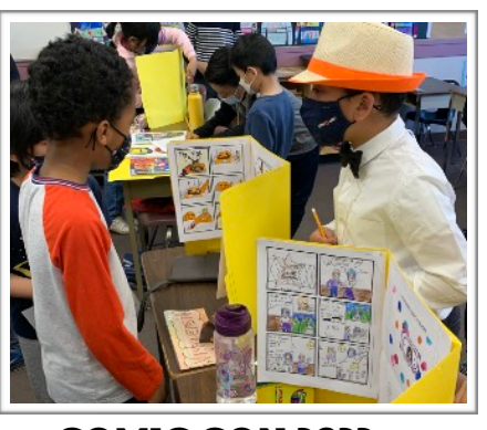
COMIC CON 2022

Is your child going to be absent? Or late? Please call our early warning line: